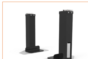
Electric Mini Lift