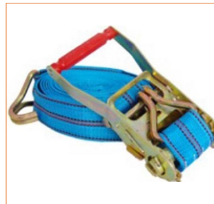
Adjustable Safe Strap