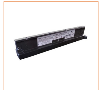
Height Adjustable Mobile Beam